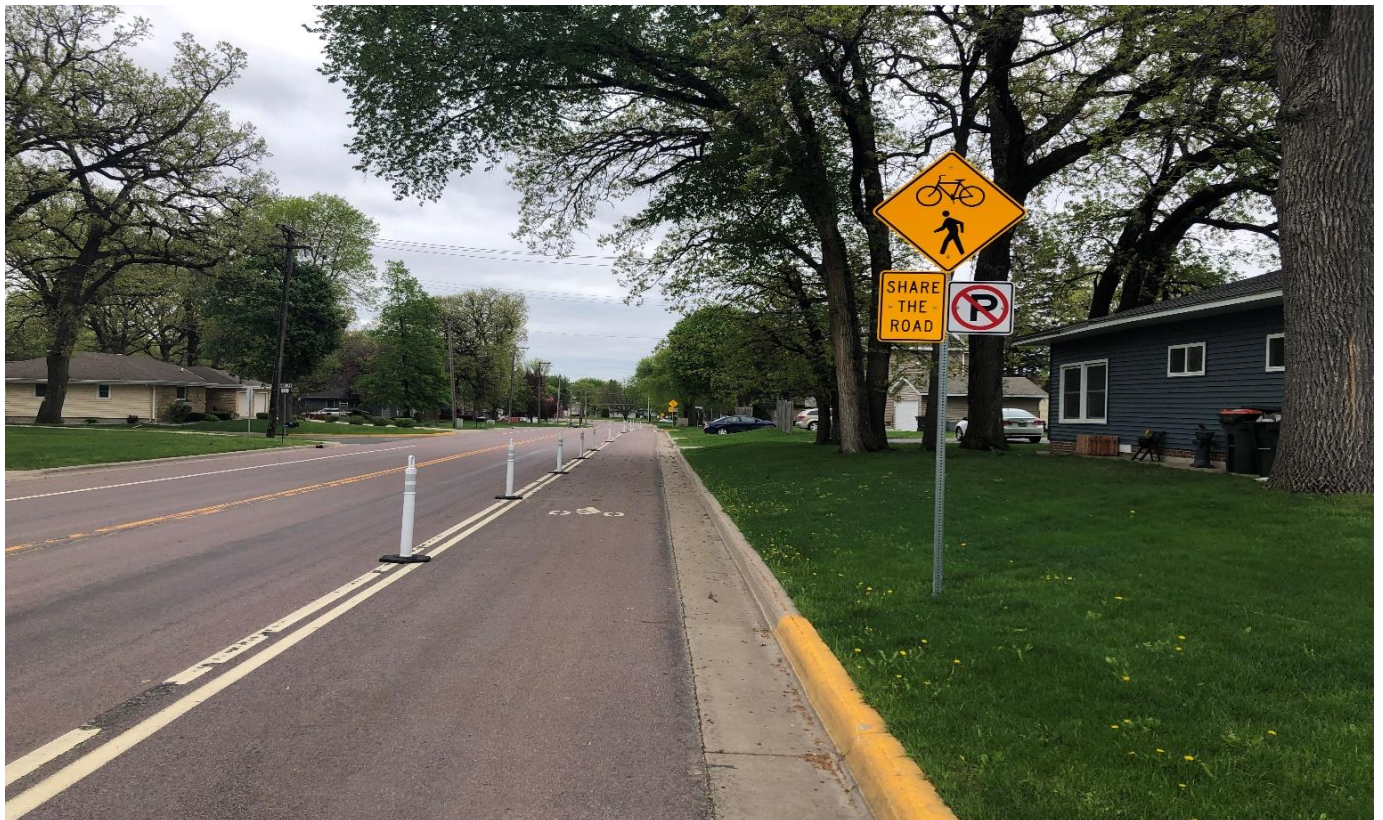
Sibley County and the City of Gaylord Example- Design for Bike Lane with both directions on the same side of the street.

The Glencoe in Motion group has a goal to establish a local bicycle system that conveniently connects people to important destinations by bicycle all around the city. Striping on street bike lanes and reallocating roadway space to create bikeways is a cost-effective way to complete the bike network and provide separated facilities that feel comfortable for people of all ages and abilities.